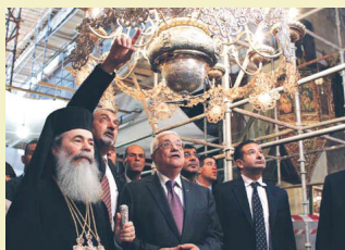
Palestinian Perseident "Mahmoud Abbas" follow up visit to the Nativity Church on Oct. 25 th 2010

The idea of exposing the extraordinary mosaic floor still hidden below the modern floor is currently under evaluation in order to make the hidden mosaics visible to visitors and scholars especially in the nave where a specially designed glass floor will be placed to replace the existing marble slabs and wooden covers.