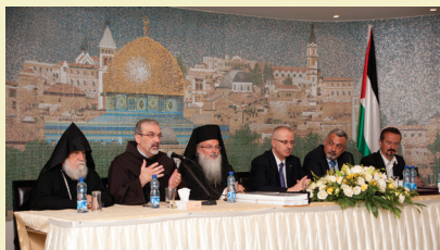
Signing ceremony of Phase I contract with "Piacenti spa" in Aug. 26 th 2013 in the presence of the Presidential Committee Chairman, Prime Minister Dr. Rami Hamdallah and the head of the three churches